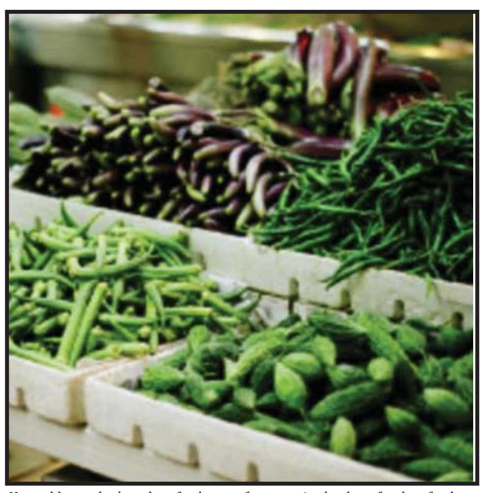
Vegetables, and other plant foods, are often perceived to be safer than food derived from animals; however research facts do not fully support this belief.

No separation exists between perceived animal welfare and perceived food safety. While the first priority of producers of meat, eggs and dairy products is ensuring food