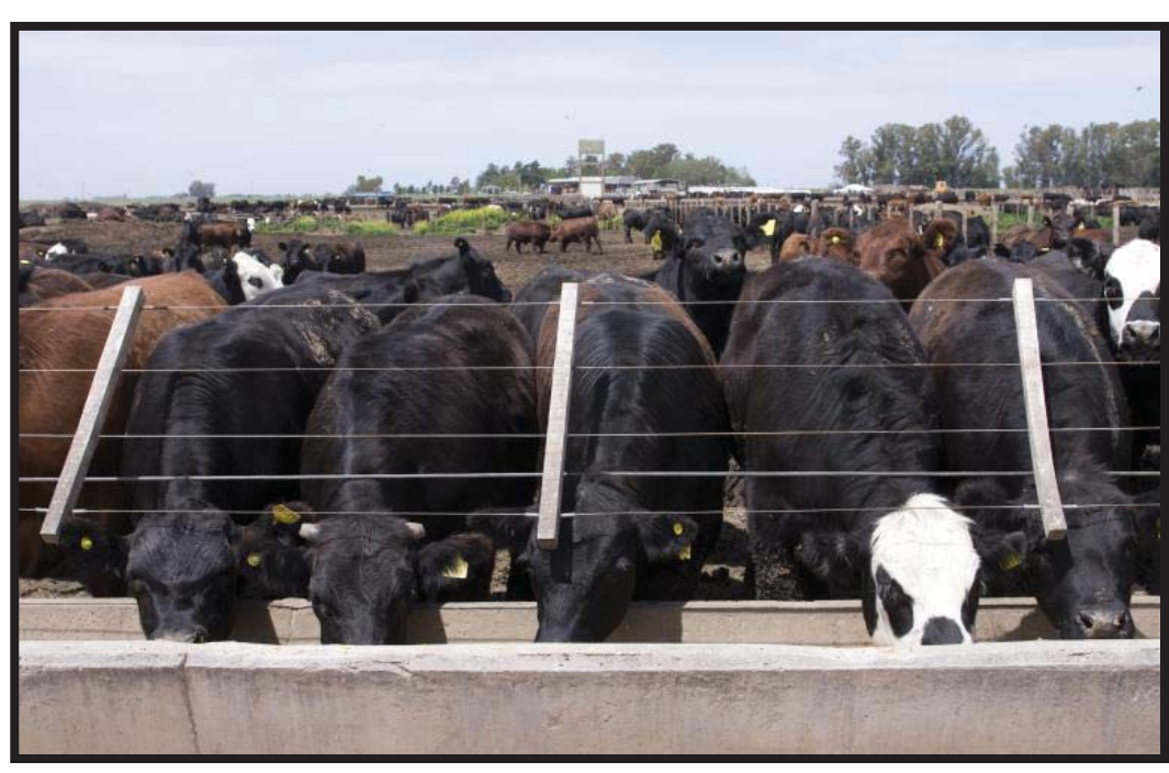
Packer-owned feed lots are one of the captive supply procurement methods considered in this research

The researchers test the causal relationship between cash market