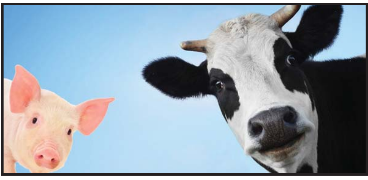
Several elements impact whether farm animal welfare determines food safety, but public perception is a major factor.

investigated to calculate the number of annual illnesses and deaths attributable to different foods and the economic costs of the illnesses