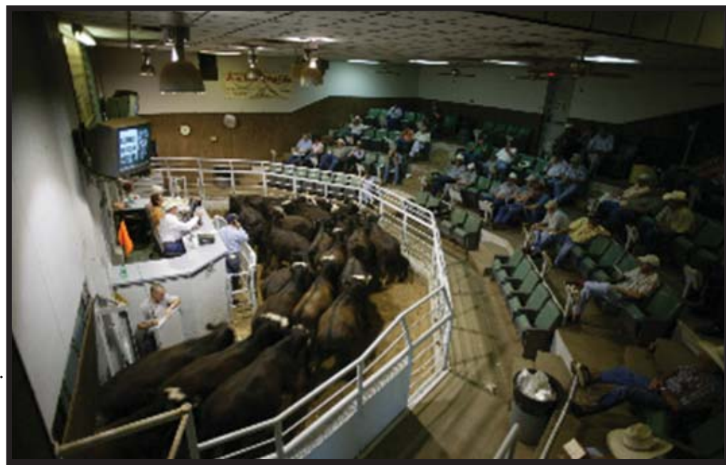
Marketing power and efficiency effects are important factors in buying and selling cattle such as these at the Oklahoma National Stockyard, Stockyard City, which is the home of the largest stocker/feeder cattle market in the world.

Finding the correct causal direction between captive supplies and cash market prices could provide useful information in the packers anti-competitive debate. It should also help researchers find better econometric specifications for the cash market price-captive supply