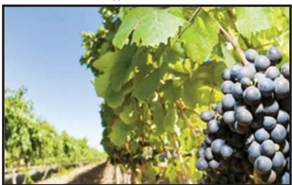
Grapes are a widespread specialty crop in Oklahoma.

The project is an attempt to provide newly emerging vegetable