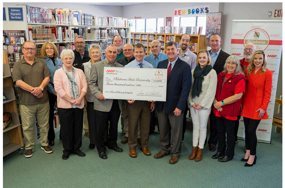
In 2018, the American Association of Retired Persons (AARP) Oklahoma provided a $3,000.00 grant to fund 12 Internet mobile hotspots. In June of 2019, AARP Oklahoma provided an additional $5,000.00 grant to fund 22 more devices.

Readers can access the program's website at http://agecon.okstate.edu/hotspot/ . They can also access the following reference, which provides more background into the initial four pilot sites and provides detailed results of the patron surveys: https://www.joe.org/joe/2019april/a2.php .