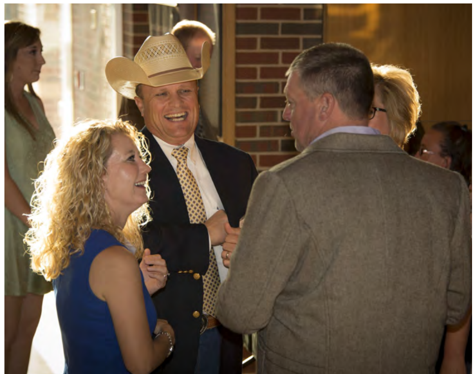
Animal Science alumni at the 2015 ASAA Gala Reunion.

For one weekend a year, Animal Science alumni take a moment to recognize graduates and judging teams of the past, support graduates of the future, and honor those who have meant so much to many of us. A tradition that never lets us say good bye, but instead, "Until next time.”