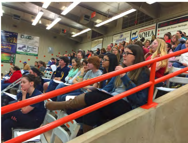
2015 OSU Horse Judging Clinic

This year, the OSU Horse Judging Clinic focused on Trail, Ranch Riding, Halter, and oral reasons. OSU horse judges worked with youth individually, providing one on one tutoring throughout the day. The OSU Horse Judging Team also attended the Oklahoma Quarter Horse Spring Show March 26th-29th at the Oklahoma City Fairgrounds.