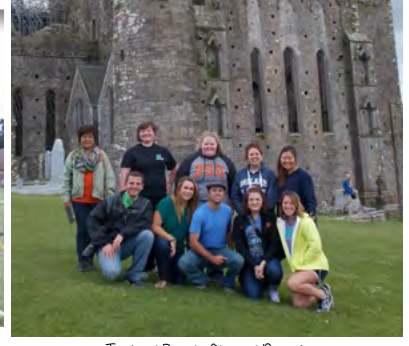
2016 OSU Judging Teams Pg. 20