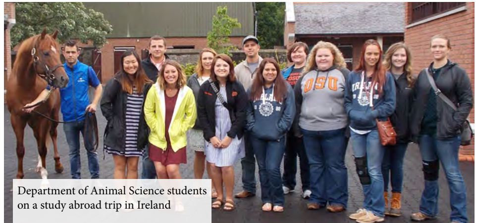
Department of Animal Science students on a study abroad trip in Ireland